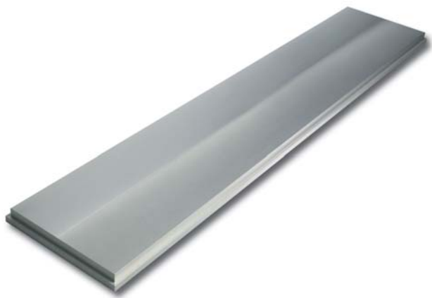
TiAl sputtering target

Other targets in accordance with customers' specifications are available on request.