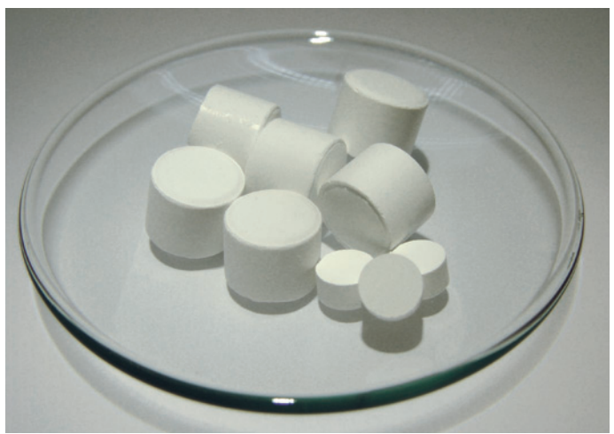
Topcoat E™ tablets (large and small).

Alternatively, coating is done in constant power mode or by rate control. Special guidelines apply to each of the mentioned coater types and techniques. Only minimal process adjustment is necessary for substitution of any topcoat material by Topcoat E™.